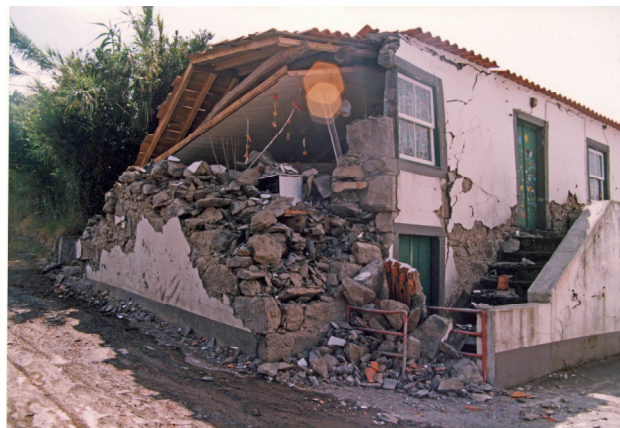
Figure 1 Salão kindergarten partial collapse. Azorean traditional construction type.

In the aftermath of the quake, a team from Instituto Superior Técnico (IST) have visited all the 21 school buildings of Faial and a quick and correct building evaluation was made for the retrieval of normal living conditions. The report (Azevedo et al. , 1998) shows little damage was detected in all schools, apart from the collapse of an exterior wall in a kindergarten (Figure 1) and two schools considered potentially dangerous were demolished (Espalhafatos and Ribeira Funda).